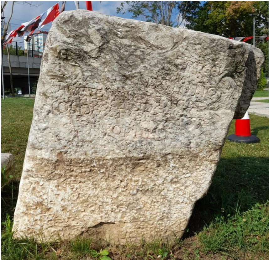
Fig. 3. Inscription no. 2 (Ataköy).