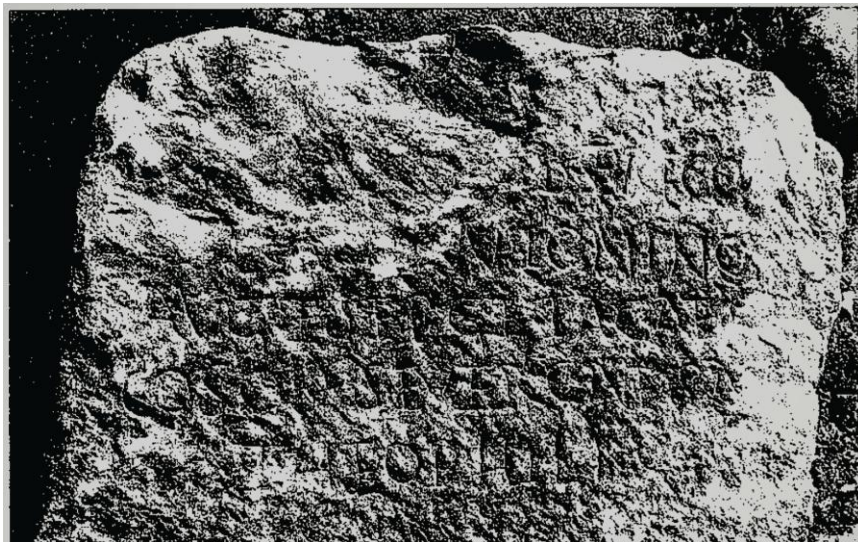
Fig. 4. Inscription no. 2 (Bacakale), Christol & Drew-Bear 1991, 144-145 no. 15, Pl. 14

Although Fant published a very similar inscription in his work, the present piece differs in line arrangement and integrity 45 . No photograph of this inscription is included in that publication. In their 1991 study, however, Christol and Drew-Bear presented four inscriptions dated to 205 CE; three of these were published for the first time, while the fourth corresponds to the inscription previously edited by Fant. Their article also contains