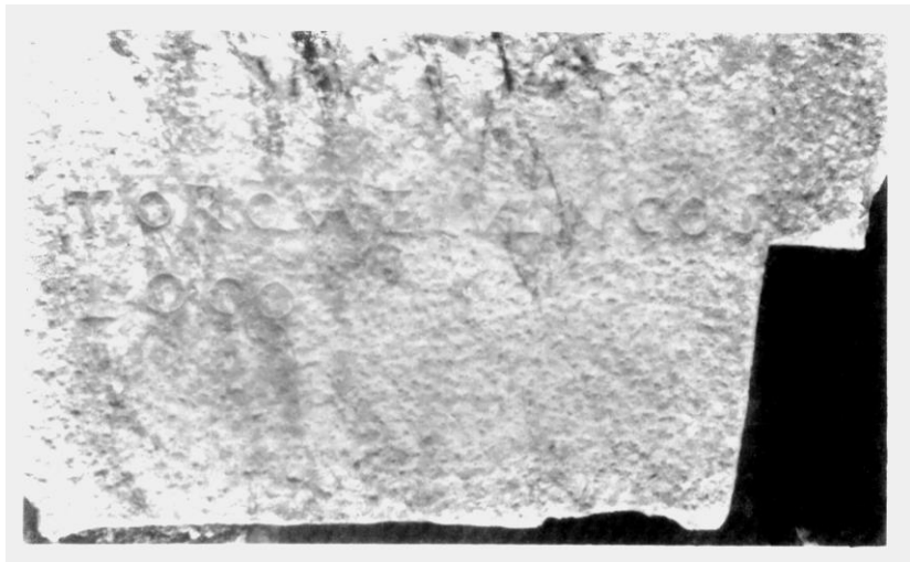
Fig. 2. Christol & Drew-Bear 1987, 87 no. 25 Pl. 29 (Bacakale)