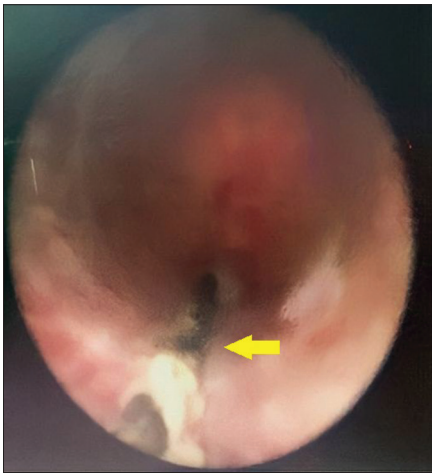
Figure 2: Sewing needle observed during urethroscopic visualization

slipped inside. Under general anesthesia, a cystoscope with a 17Fr sheath was introduced into the urethra and a long thin metallic foreign body placed parallel to the urethral axis was observed in the membranous urethra [Figure 2]. The needle was stuck inside the urethra with the eye-side embedded approximately 5 mm in the epithelium in front of the verumontanum, and the tip-side had penetrated the epithelium towards to distal aspect. A grasper was used to move the needle. The needle clutched near its proximal side was moved distally and freed from the embedding mucosa with gentle pressure to the underlying mucosa to prevent the sharp edge from penetrating deeper. Next, the needle was moved proximally and completely liberated. Finally, the needle was grasped by the sharp side and completely extracted from the urethra through a cystoscope. The withdrawn object was a 9-cm oxidized sewing needle [Figure 3]. A urethral catheter was introduced. A preliminary psychiatric evaluation was performed the following day, and no psychiatric disorder was detected. On the second day, the urethral catheter was removed, and the patient was discharged after receiving feedback that his urinary flow was normal. The most common causes of urethral pruritus are urethritis and urinary tract infections; however, the patient did not give us a clue to support any of these. Therefore, the patient was prescribed 100 mg of doxycycline per day empirically.