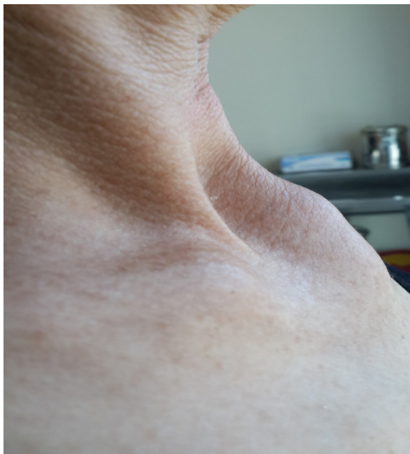
Figure 2. Redness and swelling in sternoclavicular joint.

She consulted with the department of infectious diseases. The five weeks treatment involved 900 mg rifampin and 200 mg doxycycline. She was also prescribed ibuprofen 1600 mg daily for two weeks. As a result, rapid recovery of arthritis was observed.