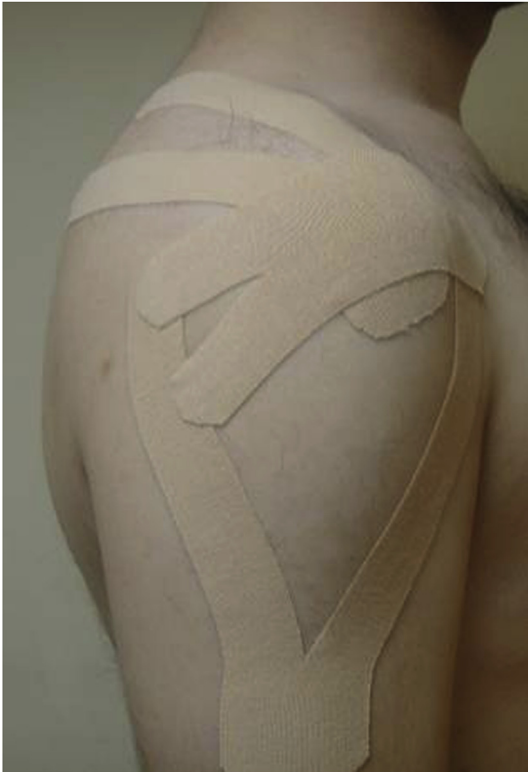
Fig. 2. The application of KT.

regarding potential damage to the rotator cuff following repeated injections into the subacromial space. 8–10 In our study we have performed the posterior route for subacromial injection. 33 Early onset pain relief following injection may be due either a placebo benefit or the spreading effect of the LA. Similar to previous