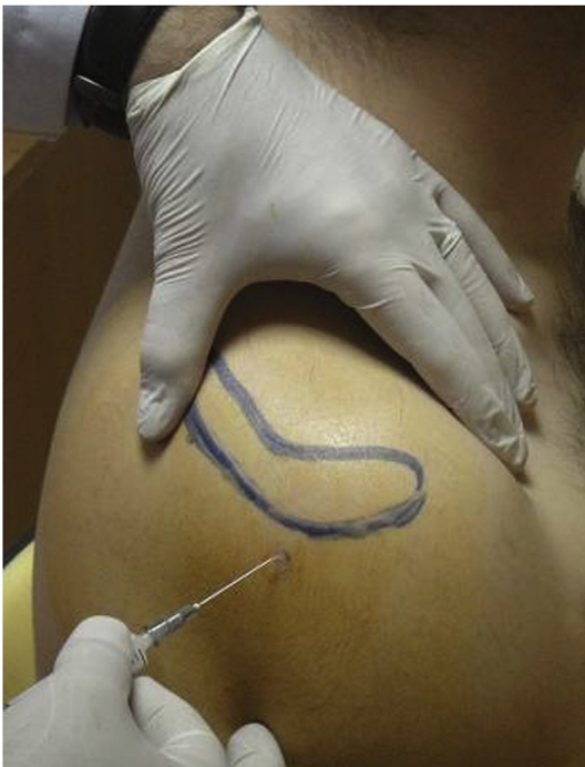
Fig. 3. Posterior subacromial steroid injection.

regarding potential damage to the rotator cuff following repeated injections into the subacromial space. 8–10 In our study we have performed the posterior route for subacromial injection. 33 Early onset pain relief following injection may be due either a placebo benefit or the spreading effect of the LA. Similar to previous