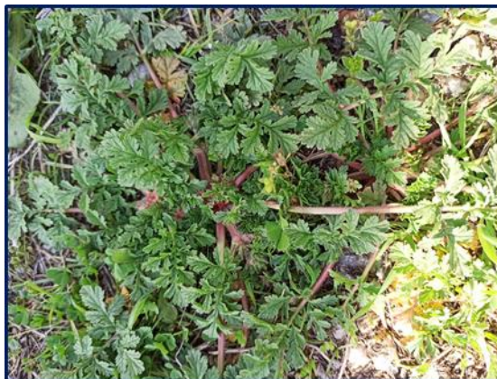
Figure 1. Erodium cicutarium plant

One of the important methods for post-harvest preservation of bioactive compounds and nutritive properties in the plant is drying. Müller (2007) stated in his study that drying is the most appropriate method especially for the preservation of medicinal and aromatic plants. In addition, the drying process provides ease of pharmaceutical use for medicinal and aromatic plants as well as storage (Lorenzi and Matos, 2002). However, the bioactive components and pharmaceutical properties of plants are affected by the drying process (Zhu et al., 2014).