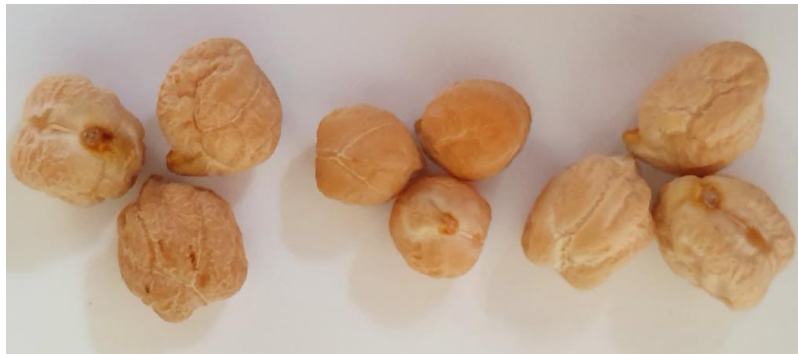
Figure 3. Seeds of a progeny (with two pods per axil and 63 g per 100 seeds, left side) in F 3 derived from intraspecific crosses between Sierra (single-podded, unifoliolate leaf and 46.9 g per 100 seeds, right side) and CA 2969 (double-podded, imparipinnate leaf and 27.4 g per 100 seeds, middle).

Transgressive segregations were found for all the agro-morphological traits (Tables 2 and 3) and the 100-seed weight in F 2 (Figure 2) and F 3 (Figure 3). Among the progeny, 30 progeny in the F 2 population had a higher 100-seed weight than that of the best parent Sierra, which had a 49.9 g one (Figure 2). A total of 131 progeny in the F 3 population had a 100-seed weight higher than 50 g (Table 3). Some of them had produced two pods and extra-large seed sizes as large as 63 g (Figure 3). Transgressive segregations were considered to be derived from the complementary action of genes and the expression of suppressed recessive genes in the parents [20,41,50,51]. As promising progeny, extra-large-seeded progeny with two or three pods per axil were isolated in F 3 (Figures 3 and 4). As outputs of the epistatic effect of the double-podded trait in a different background, three or more flowers or pods per axil were discovered in some progeny (Figure 4).