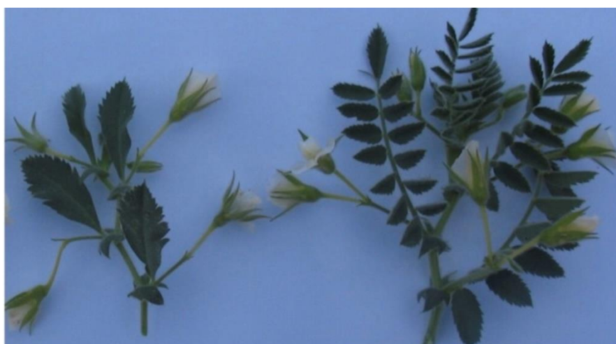
Figure 1. Morphological traits of parents, Sierra (single-podded and unifoliolate leaf, left side) and CA 2969 (double-podded and imparipinnate leaf, right side).

As reported by Auckland and van der Maesen [64], flowers of the female Sierra were emasculated at early morning and then pollinations were done using flowers of the pollen donor CA 2969 within one hour at the campus of Akdeniz University, Antalya, Turkey (30°38' E, 36°53' N, 51 m above sea level). F 1 , F 2 and F 3 plants were grown as single plant progeny and individually harvested in 2017, 2018 and 2019, respectively. The present study consists of F 1 progeny and F 2 and F 3 populations.