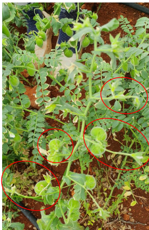
Figure 4. A progeny in F 3 (with three flowers per axil, unifoliolate leaves and large seeds) derived from intraspecific crosses between Sierra (single-podded and unifoliolate leaf) and CA 2969 (double-podded and imparipinnate leaf). Red circles indicate three flowers/pods.