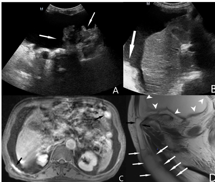
Figure 1. Ultrasonographic Images; Intraabdominal fluid accumulation and peritoneal tumoral implants in the left (A) and right upper (B) quadrants. Contrast-enhanced axial magnetic resonance image (C) shows intraabdominal fluid and enhanced peritoneal implants (Black arrows). T2 weighted sagittal magnetic resonance image (D) shows intra-abdominal fluid (arrowheads), the hernia sac and fluid extension to the scrotum along the right inguinal canal (arrows)