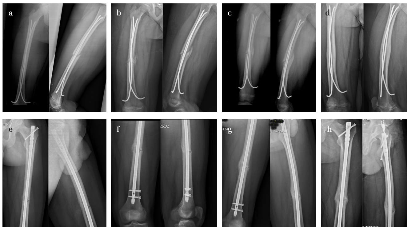
Figure 2. a-h. Postoperative 4 (a and e), 8 (b and f), 12 (c and g), and 16-week (d and h) follow-up AP and lateral radiographs of pediatric and adult patients. The radiographic union scale in tibial fractures and modified radiographic union scale in tibial fractures scores of the pediatric patients (a to d) are higher than the adult patients (e to h) at all time points. AP: anteroposterior