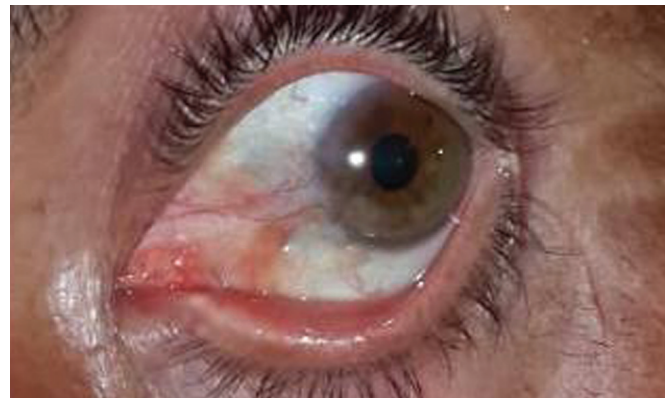
Figure 2: Postoperative 6 th month recurrent pterygium.